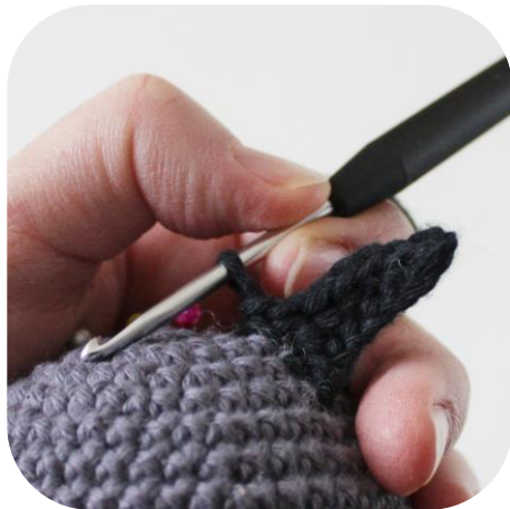
ILLUSTRATION 1 - CREATING THE HAIR STRANDS (2)