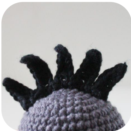
The ruffled hair.

Finish all the hair strands like this, then make a chain again to create the next hair strand. After crocheting the hair strands, secure them to the head with a few stitches.