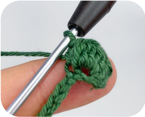
Illustration 1 – Crocheting the arms