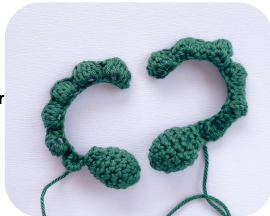
Illustration 1: Crocheting the arms

Fasten off (no hole at the hands), weave the ends. To sew on, cut new yarn and attach the end of the arms to the body! Sew arms on each side of the body.