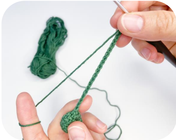
Illustration 2 – Crocheting the legs