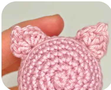
Illustration 1: Crocheting the ears

R8: 10sc; FLO (first ear): [1slst; inc(3dc +2ch then crochet from the 2nd ch from the hook 1 slst; 2 dc; 1 hdc); 1 slst]; in both loops: 4sc; FLO (second ear): [1slst; inc(3dc +2ch then crochet from the 2nd ch from the hook 1 slst; 2 dc; 1 hdc; 1 slst)]; from here in both loops 10sc (30 BLO)