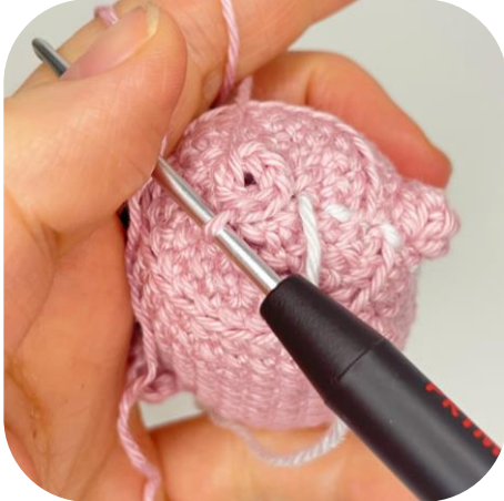
Illustration 3: Crocheting the tail