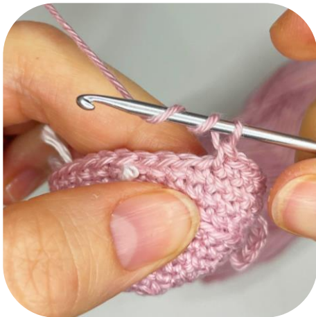
Illustration 2: Crocheting the legs