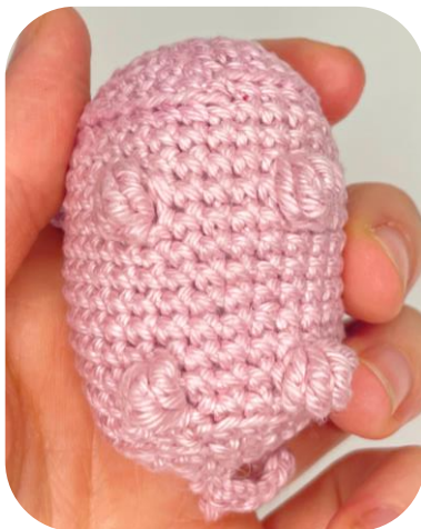
Illustration 3: Crocheting the tail

Twist the tail a little to make it curl!