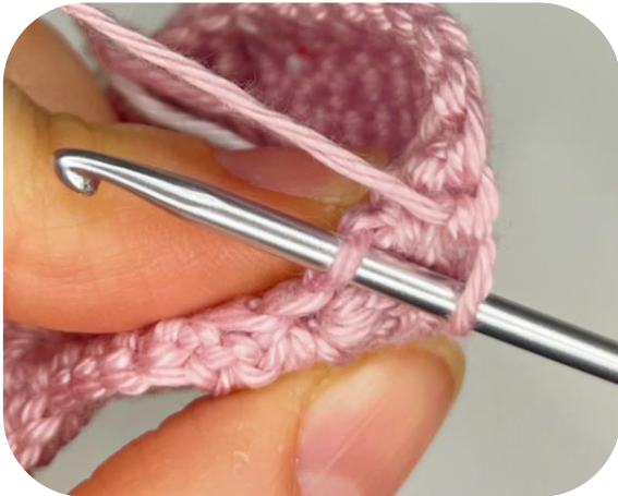
Illustration 1: Crocheting the ears (2)